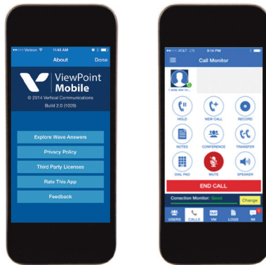
Vertical's Wave ViewPoint Mobile application – the only mobility solution that comes standard – delivers the Wave IP 500's advanced UC features anywhere you need to be on both Android and iOS-based devices.

Unlike other solutions that offer support for IP applications but which require additional hardware and software – at additional costs – the Wave IP 500 comes complete with embedded telephony and fully functioning UC capabilities including collaboration, presence management and enterprise mobility applications that are easy to use and deploy. All native Wave IP 500 UC applications are available at no extra cost and ready to use when you are with a single base user license included with every Wave IP system.